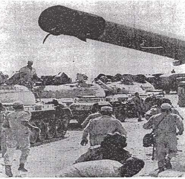
Soldiers of the United Arab Republic refueling vehicles on Friday during a stop on trip toward the Israeli border.