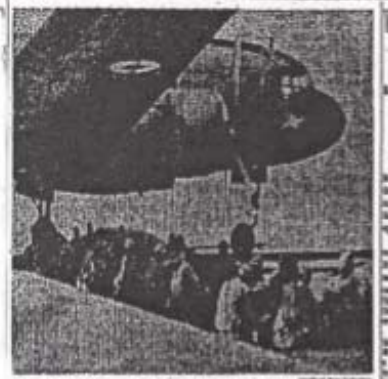
DESERT CUTPORT: Troops of the United dark Republic med shale make the inches to place after serious at Blaces of Black, on the Inglets alone the Trace Street of Black of Applie. Command yout was between younged by twops of the United Fallows