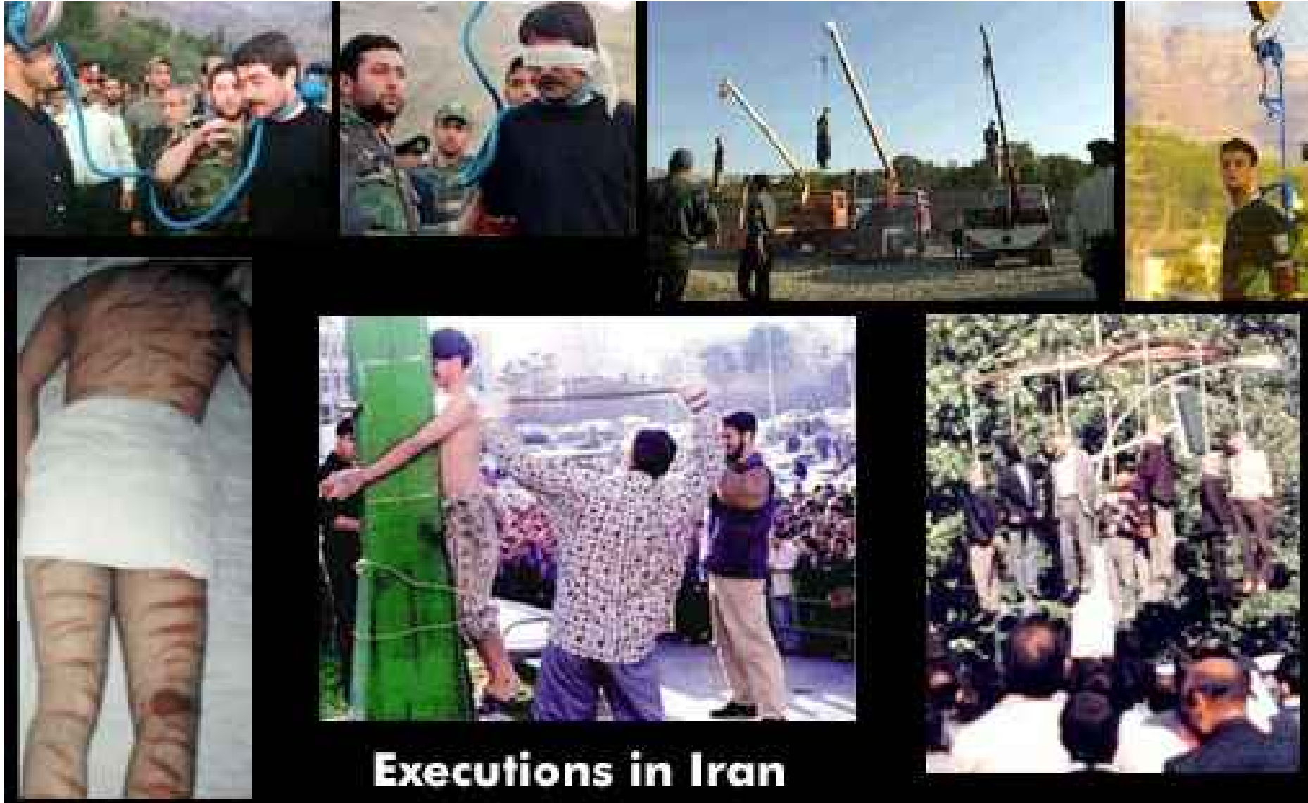
Executions in Iran