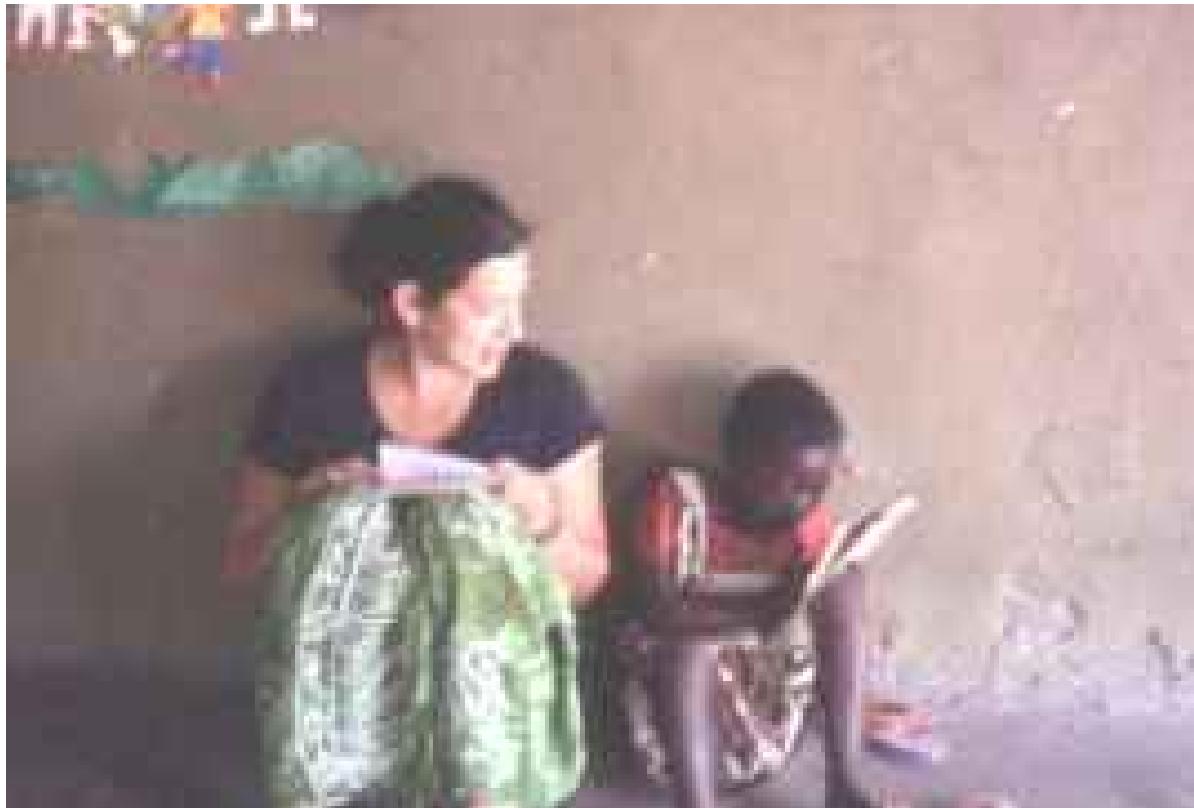
A teacher and child at an Israeli AIDS project in Malawi

Could the Israelis be the good guys after all... ? Could this be 'Israeli apartheid' in action ?