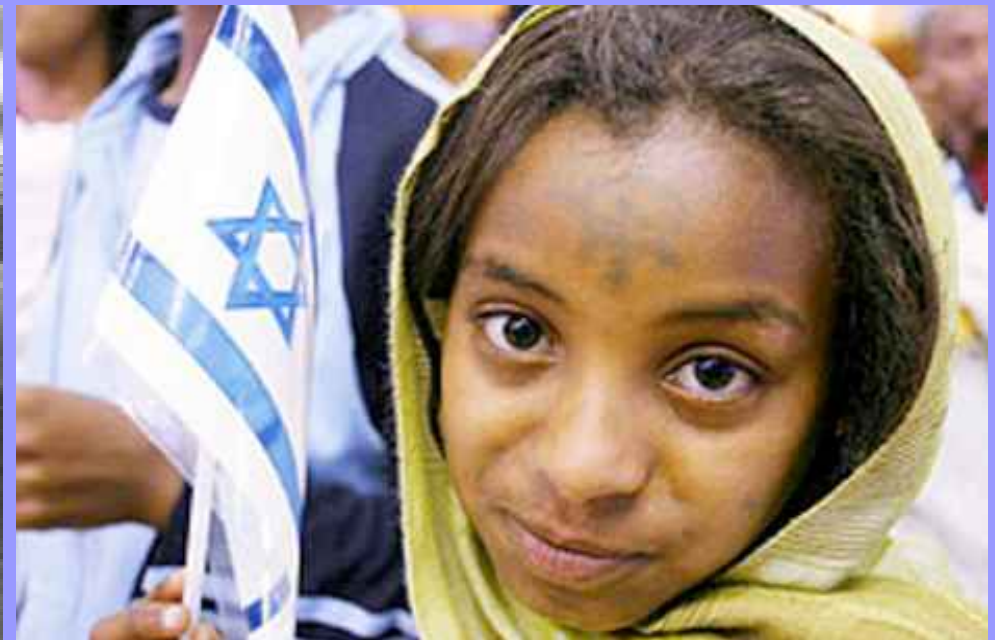
Years later, an Ethiopian refugee starts a new life