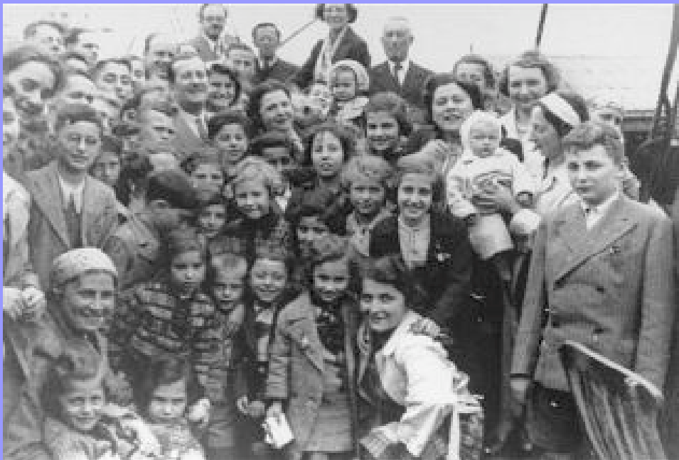
Survivors of the death camps head for the Promised Land

How can such a country be described as an 'apartheid state'?